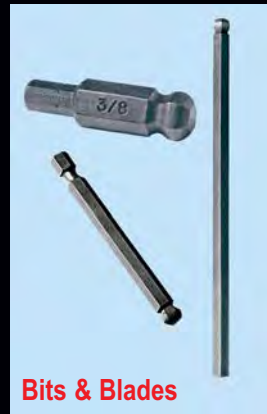
Bits & Blades