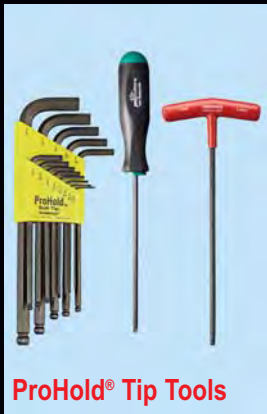
ProHold® Tip Tools