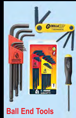
Ball End Tools